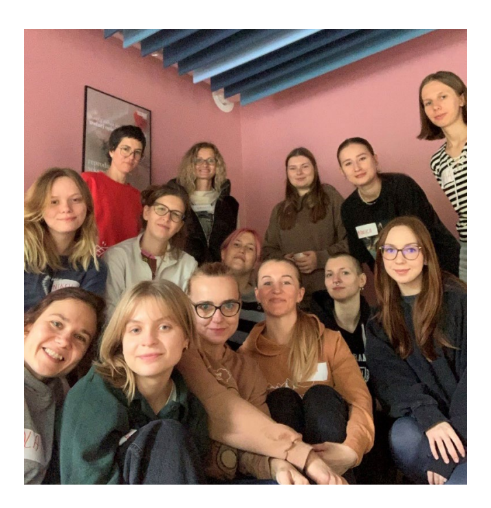
Participants and trainers during WenDo workshops at the FEDERA Health Center – October 2024.

These workshops empowered participants by strengthening confidence, self-protection skills, and assertiveness in everyday life.