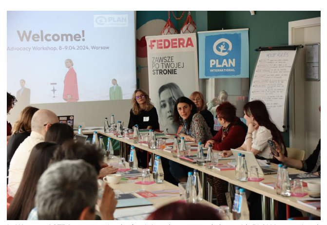
In Warsaw, ASTRA co-organized a feminist advocacy workshop with PLAN International, where FEDERA conducted a training session on strategic communication and effective responses to political challenges.

In 2024, ASTRA's Secretariat organized two online workshops on fundraising, led by an experienced expert, equipping members with practical tools and strategies for financial sustainability in the field of sexual and reproductive rights.