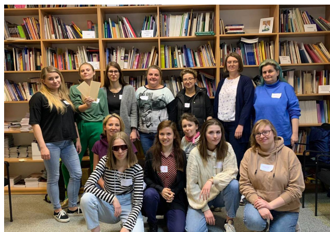
WENDO workshops at the Foundation's headquarters