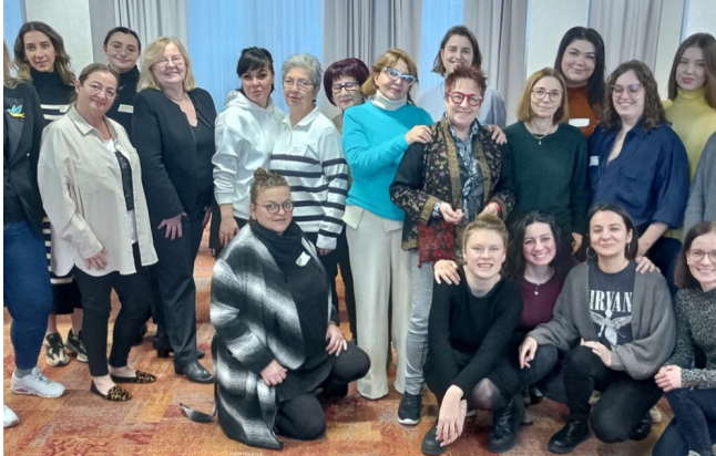
Meeting of member organizations, December 2023

we will be able to directly help people, providing them with access to decent, free medical care based on the latest medical knowledge. We devoted 2023 to preparations for the opening of our Center. We rented premises in the very center of Warsaw, hired an architect and a construction team, and then started the renovation. We have adapted the space to the requirements of the Sanitary and Epide-