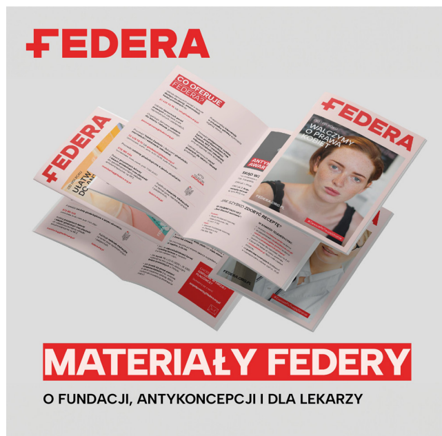
SOME Post presenting the Foundation's printed materials, November 2023

In total, 228 people signed up, but only 65 could take part, as there was a limit of 12 people per workshop (a group larger than that makes it impossible for participants to benefit fully.) The youngest participant was 20 years old and the oldest was 55.