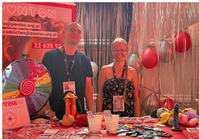
PONTON group at Open'er Festival, July 2023.