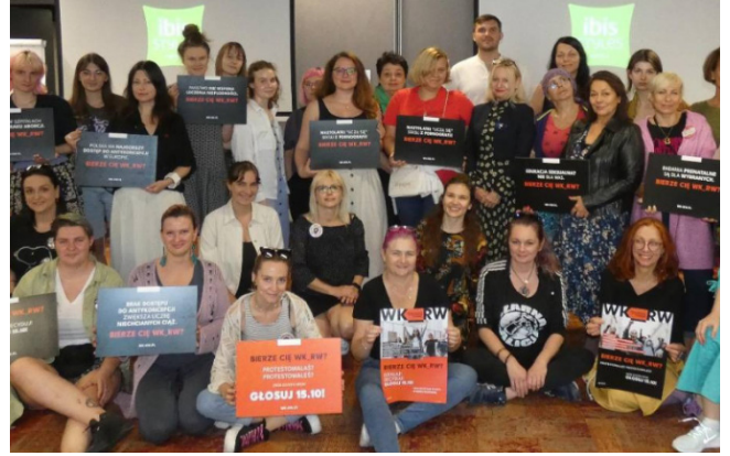
5th Congress of the Great Coalition for Equality and Choice, September 2023.

ASTRA Network is a coalition of non-governmental organizations from the Eastern European region and Central and Central Asia, working together for health and reproductive and sexual rights. The network, founded in 1999 at a regional meeting organized by FEDERA's predecessor – the Federation for Women and Family Planning, currently brings together 41 organizations from 20 countries (full list here). The secretariat of ASTRA is located in the Warsaw office of the FEDERA Foundation.