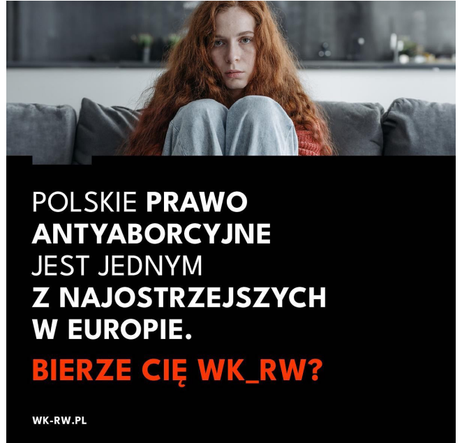
Example of the campaign "Are you pis*ed?", October 2023.