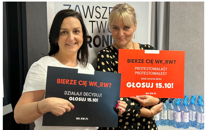
Example of the campaign "Are you pis*ed?", October 2023.