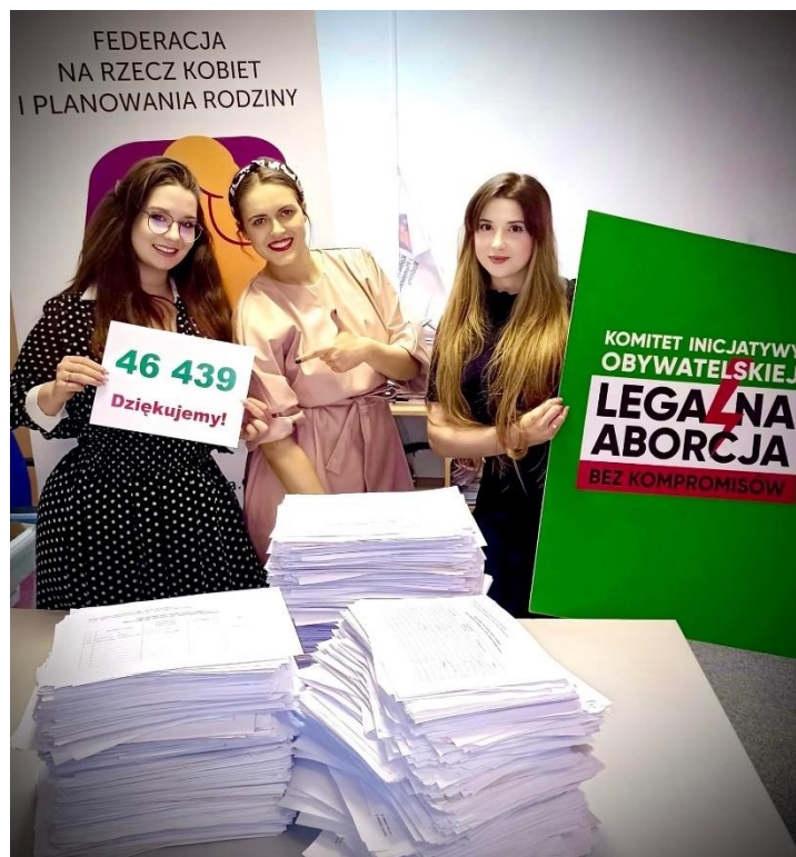
Results of the collection of signatures under the LABK draft bill in FEDERA's office, Feb. 2022.

In February, the Civic Committee of the Legal Abortion. No Compromise Legislative Initiative announced the end of the collection of signatures for the bill. The FEDERA office was one of several places to which, for months, sheets with signatures of citizens supporting the bill aiming to legalize abortion were flowing from all over Poland as well as from abroad.