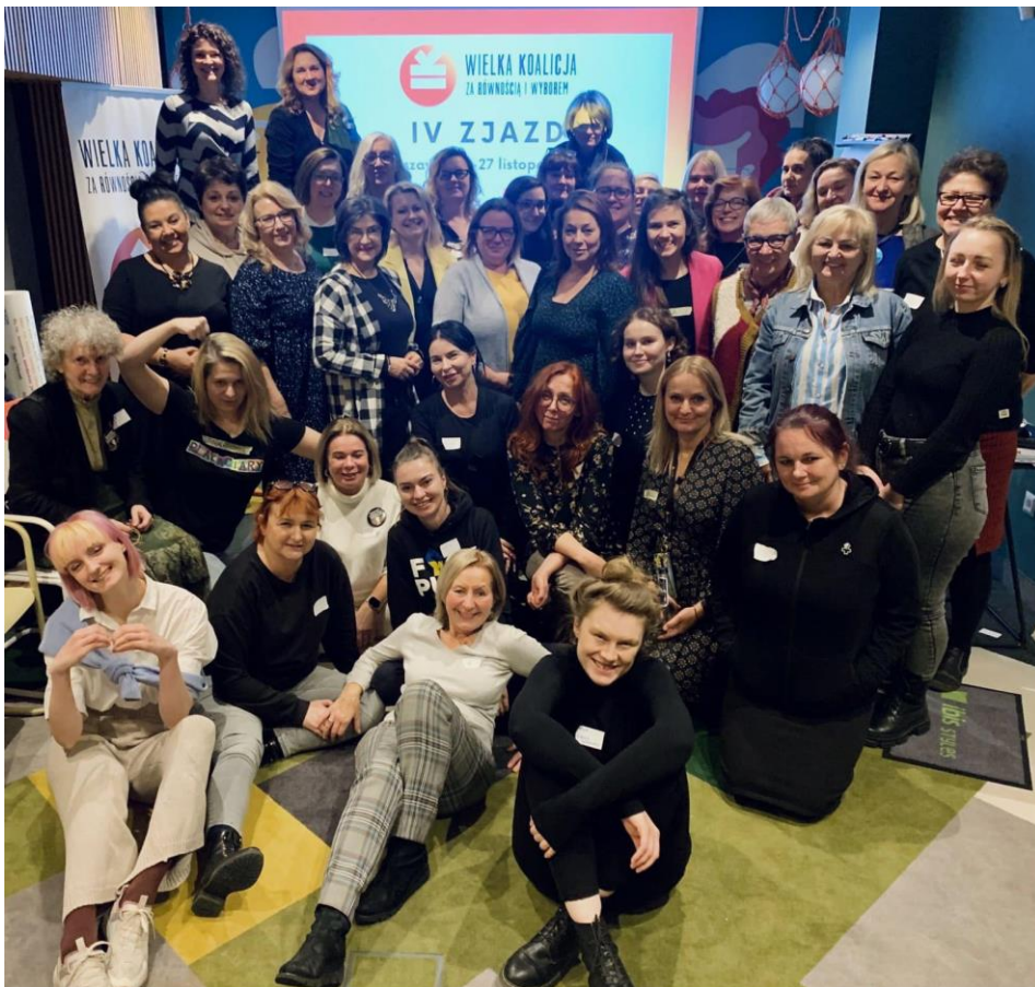
Participants of the Great Coalition for Equality and Choice meeting, November 2022.

On November 27 and 28 in Warsaw FEDERA held another meeting of the Great Coalition for Equality and Choice member organizations. During the event, representatives of member organizations shared their experiences and participated in panel discussions on "Actions supporting refugee women* from Ukraine in Poland", "Feminist strategies of resistance", and "How to help in abortion."