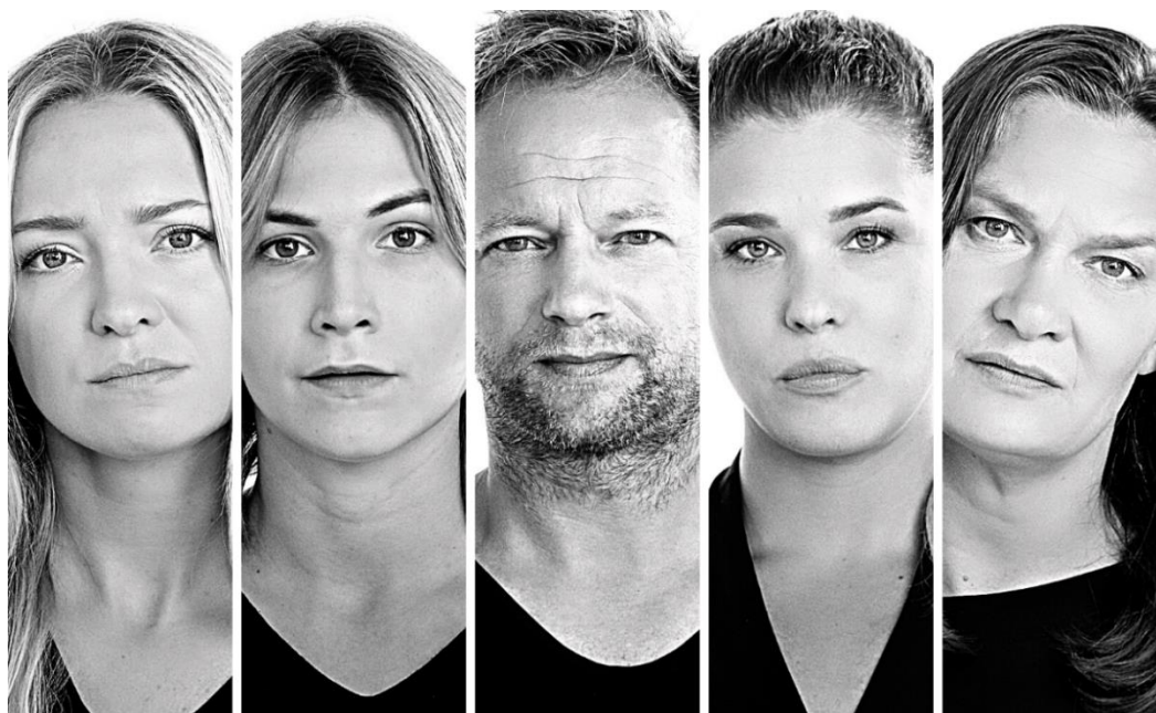
Actresses and actor featured in our STORIES OF WOMEN #ChoiceNotBan campaign.