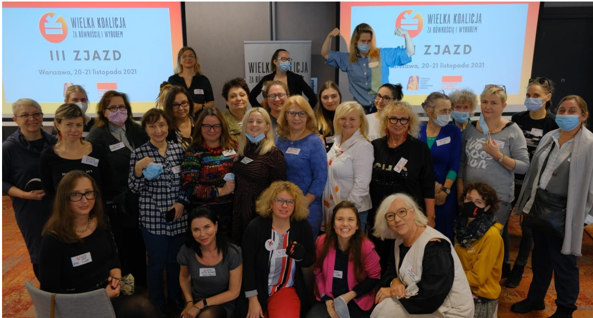
Participants of the 3 rd meeting of WKRW's member organizations' representatives (20/11/2021).