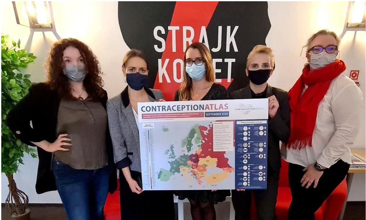
Presentation of the Contraception Atlas 2020 – Warsaw, October 2020.