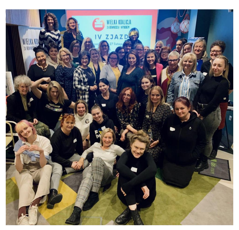
Participants of the Great Coalition for Equality and Choice meeting, November 2022.

On November 27 and 28 in Warsaw FEDERA held another meeting of the Great Coalition for Equality and Choice member organizations. During the event, representatives of member organizations shared their experiences and participated in panel discussions on "Actions supporting refugee women* from Ukraine in Poland", "Feminist strategies of resistance", and "How to help in abortion."