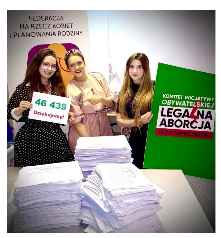
Results of the collection of signatures under the LABK draft bill in FEDERA's office, Feb. 2022.

In February, the Civic Committee of the Legal Aborton. No Compromise Legislative Initiative announced the end of the collection of signatures for the bill. The FEDERA office was one of several places to which, for months, sheets with signatures of citizens supporting the bill aiming to legalize abortion were flowing from all over Poland as well as from abroad.